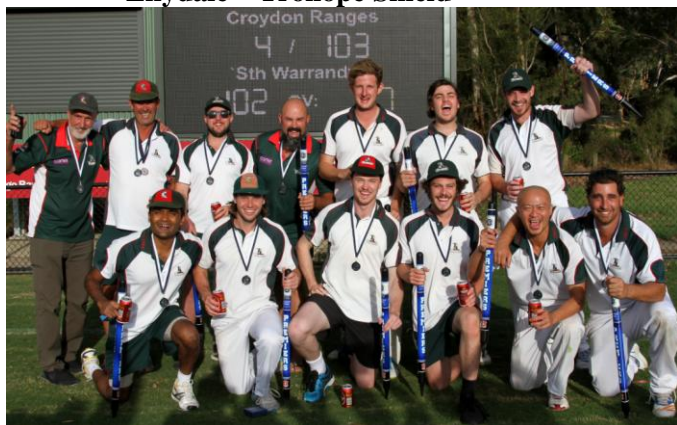
Croydon Ranges – Newey Plate