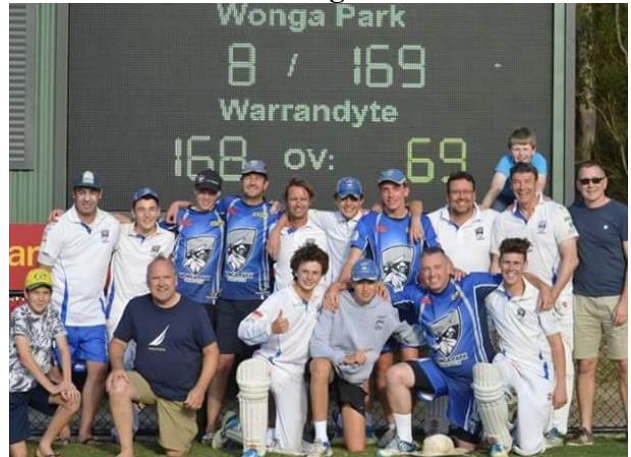
Wonga Park – “K” Grade