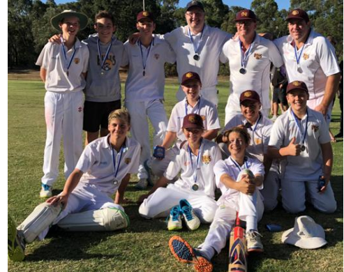
North Ringwood – “I” Grade