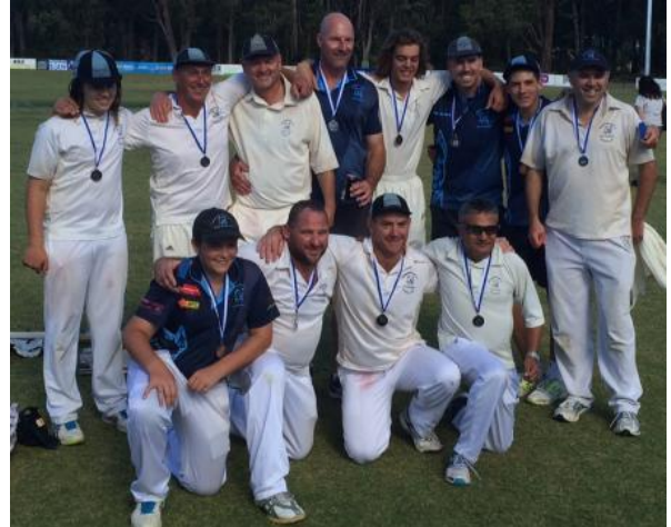
Mooroolbark “G” Grade