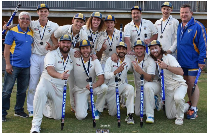
Lilydale – Trollope Shield