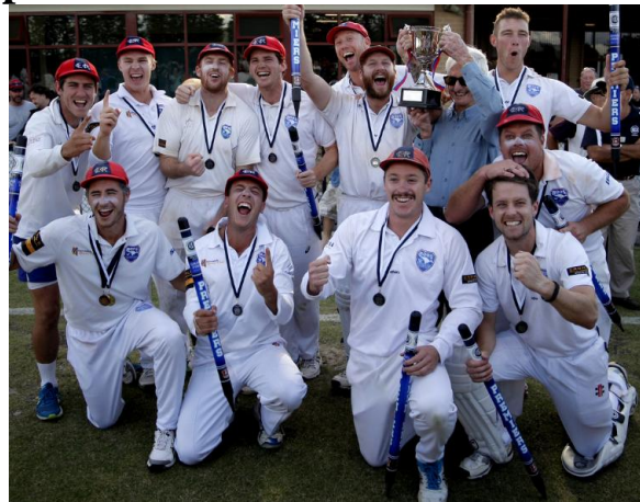
East Ringwood – Wilkins Cup