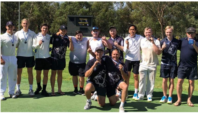
South Croydon – “D” Grade