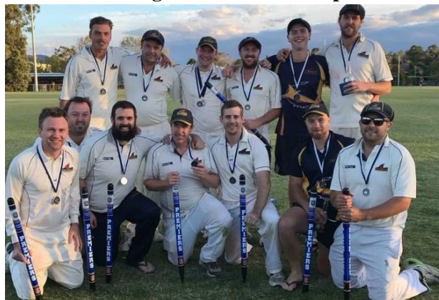
Bayswater Park – Pascoe Shield