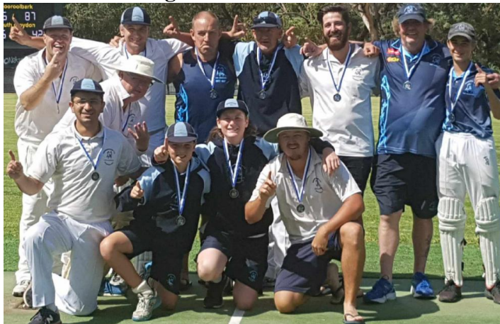
Mooroolbark – “J” Grade