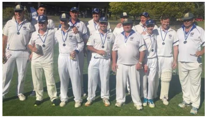
Wonga Park – “F” Grade