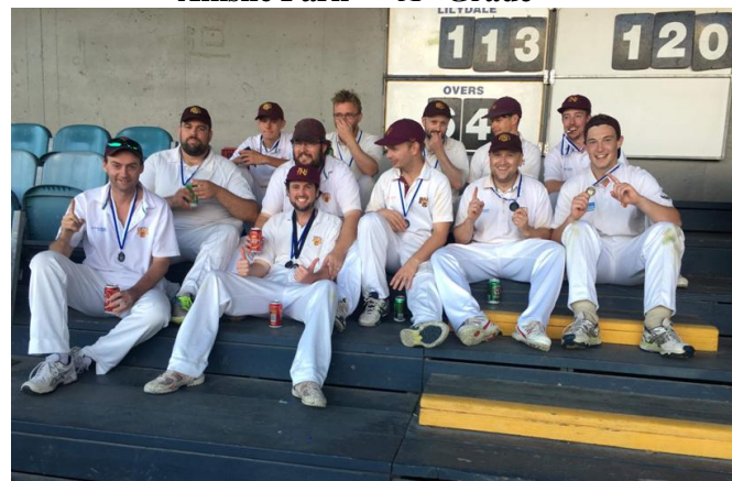
North Ringwood – "C" Grade