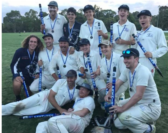
South Croydon – Meehan Shield