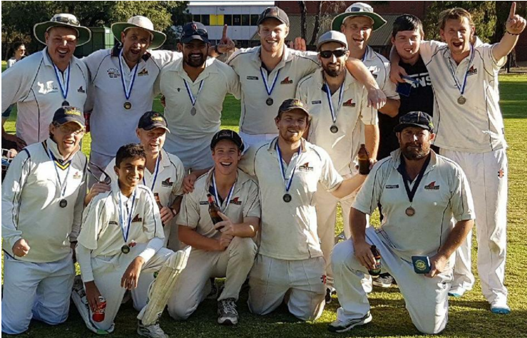
Bayswater Park – “F” Grade