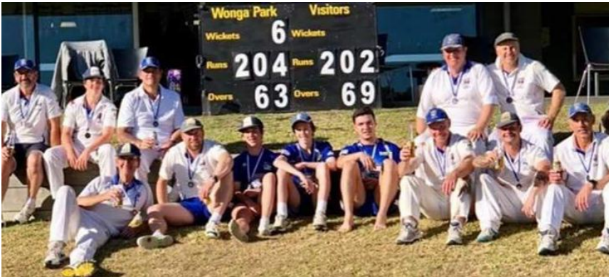
Wonga Park – “H” Grade