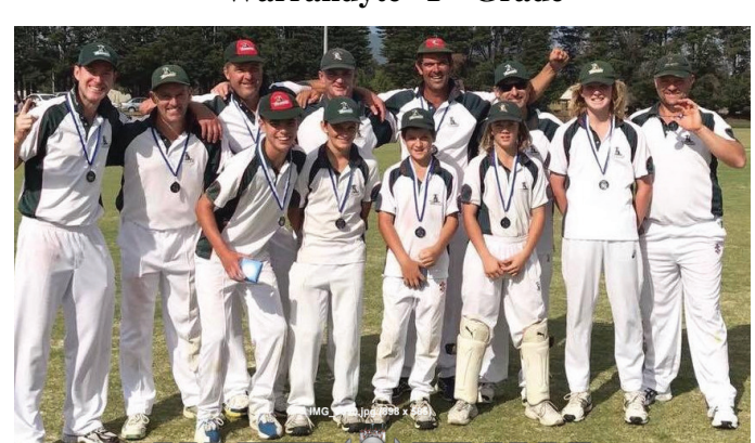
Croydon Ranges "H" Grade