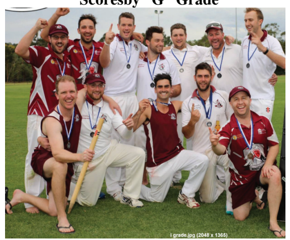
Croydon North "I" Grade