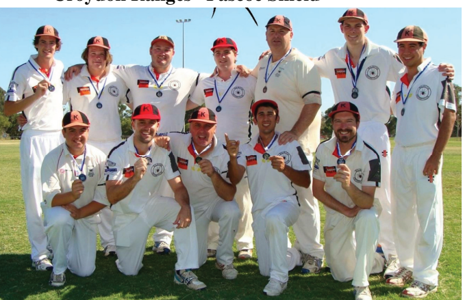
Kilsyth "B" Grade