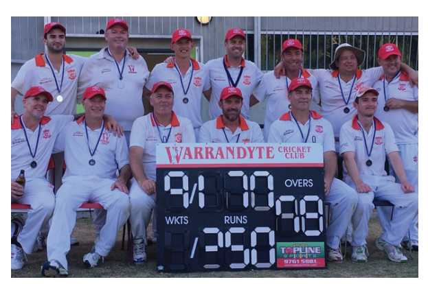
Warrandyte "F" Grade