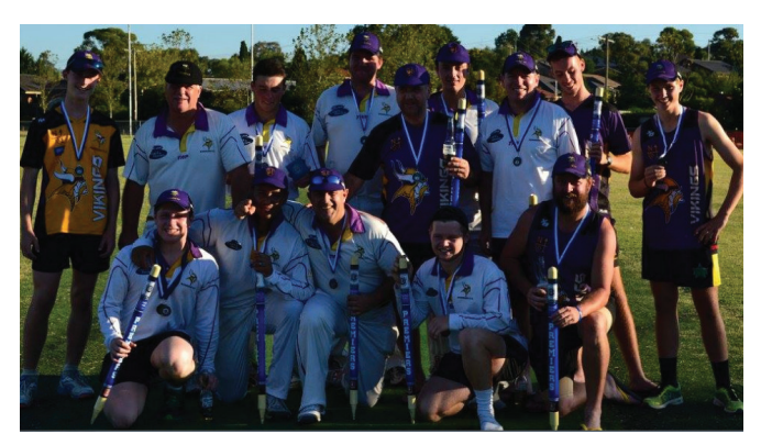
Norwood "Newey Plate"