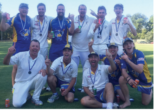
Lilydale "D" Grade