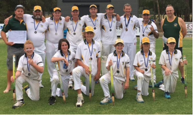
Warranwood "L" Grade