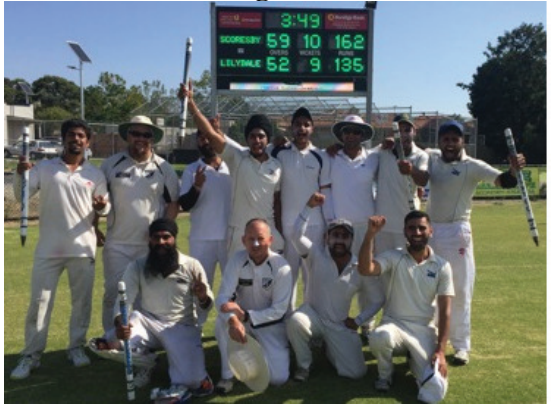
Scoresby "G" Grade