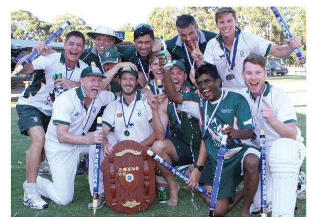
Wantirna South "Trollope Shield"