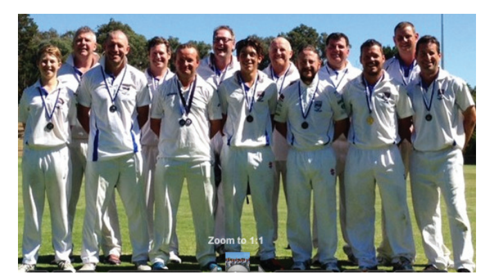
Wonga Park "E" Grade