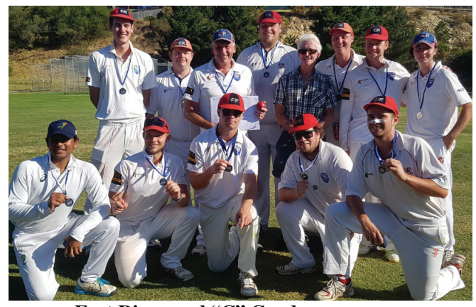
East Ringwood "C" Grade