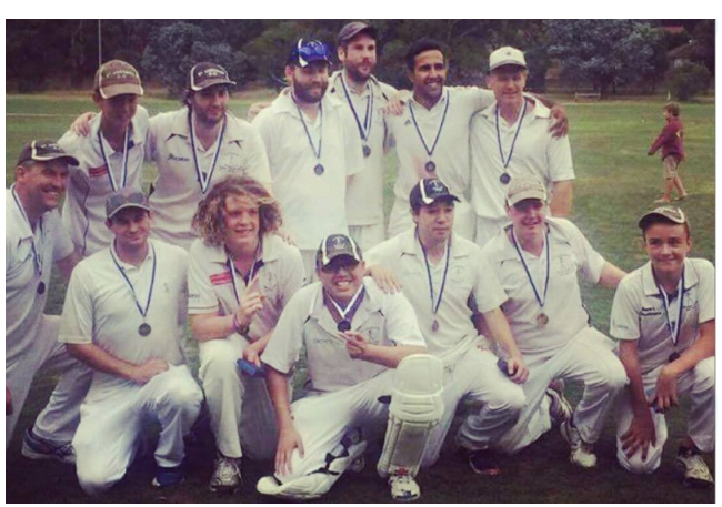
St Andrews "J" Grade