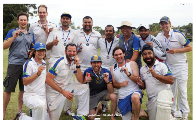
Wantirna "K" Grade